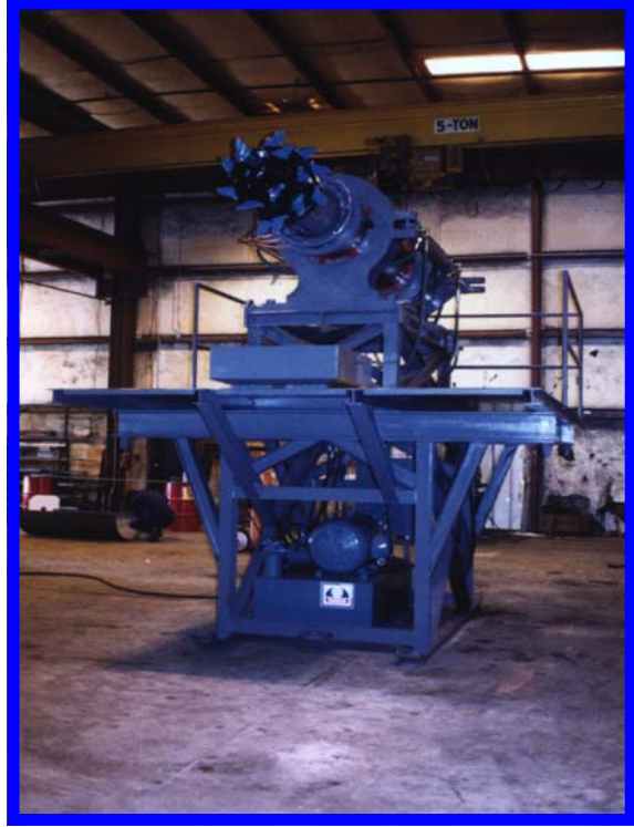
Dosco Tuyere Cutter – North West Alloys –U.S.A.