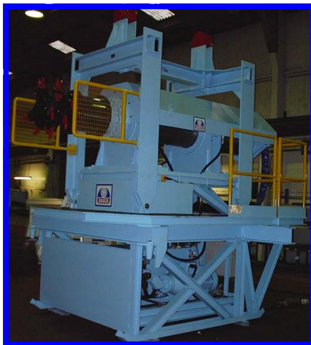
Dosco Tuyere Cutter Side View – P.E.M. Marignac – France

Many advantages are gained by the use of this machine and the one major advantage is that it can be installed and set to work when the temperature within the furnace is still too high and unsuitable for the old method of manually cleaning out using jack hammers, a hazardous and uncomfortable procedure for the operators.