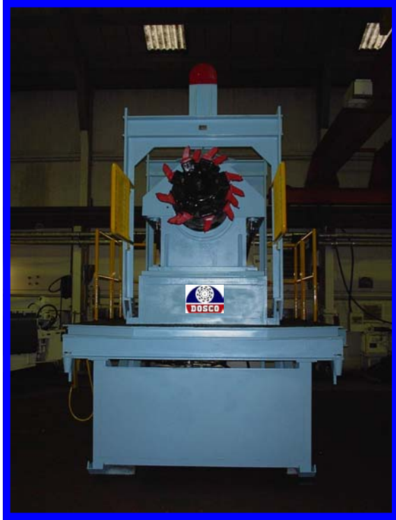
Dosco Tuyere Cutter – P.E.M. Marignac – France